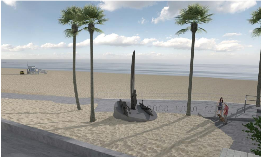
EXHIBIT A PROJECT CONCEPT PLANS