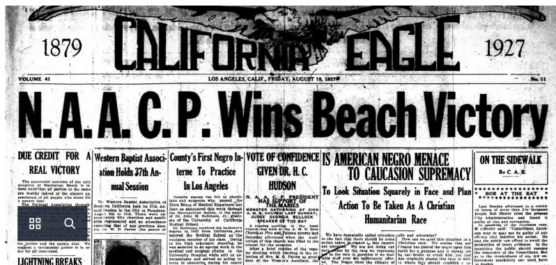
California Eagle Headline, Friday, August 18, 1927