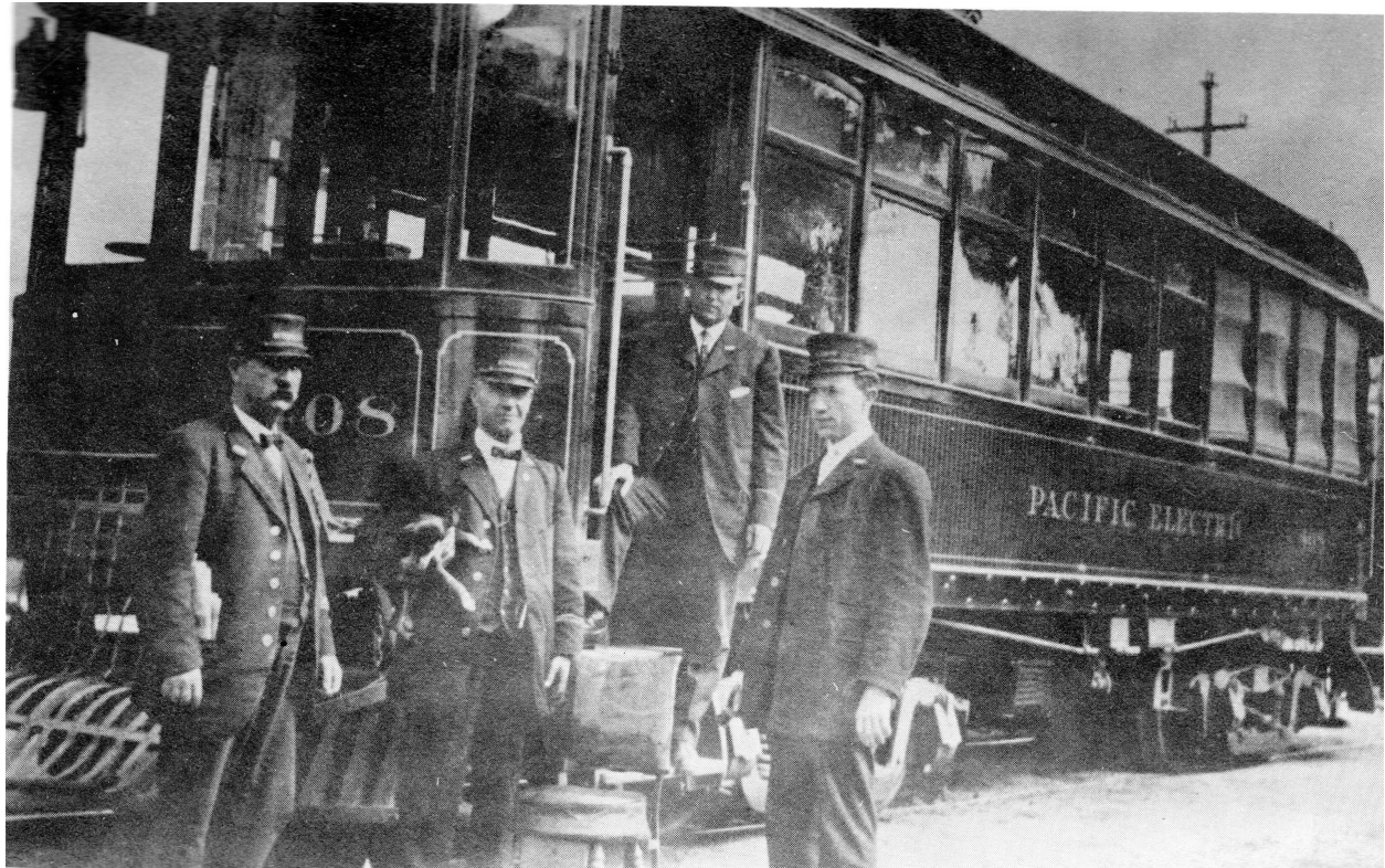
Visitors to Manhattan Beach often traveled from Los Angeles on the Red Car, circa 1916