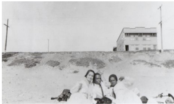
Friends gather on the sand in front of the Bruces' Resort