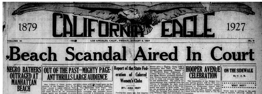
California Eagle Headline, Friday, January 6, 1927