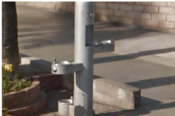
DRINKING FOUNTAIN WITH WATER BOTTLE FILLER AND DOG FOUNTAIN $XXXX