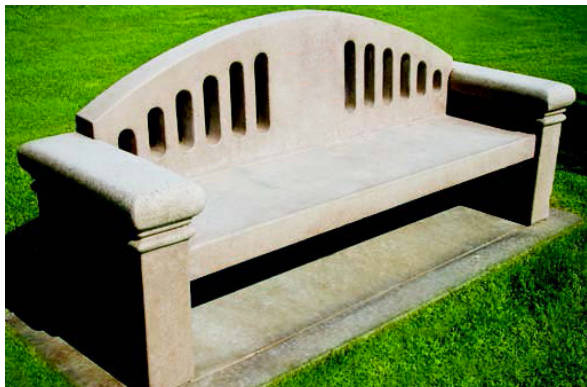
PARK BENCH $1,342