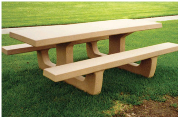
PICNIC BENCH $1,246