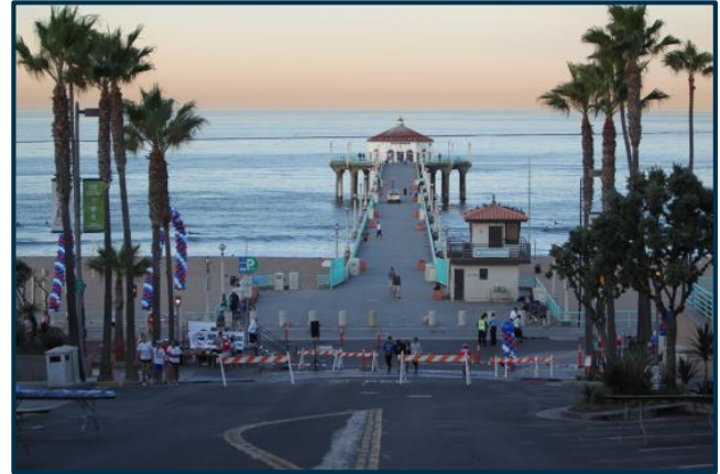
Manhattan Beach Pier*