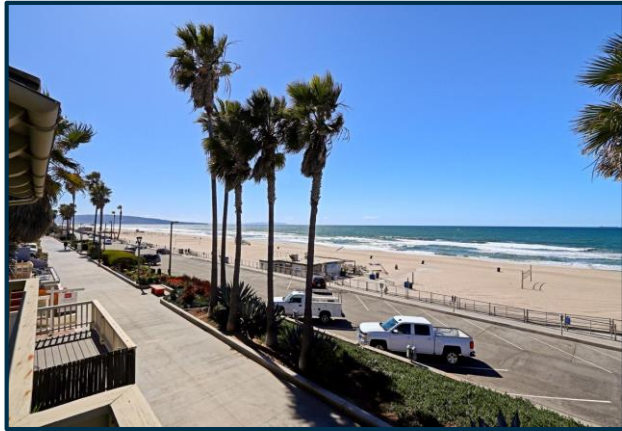
El Porto Strand