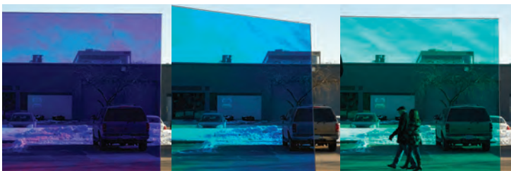
In Transmission (Shown)