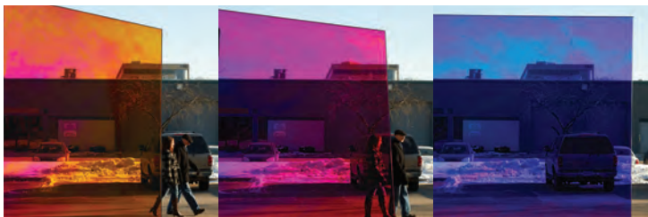
In Transmission (Shown)