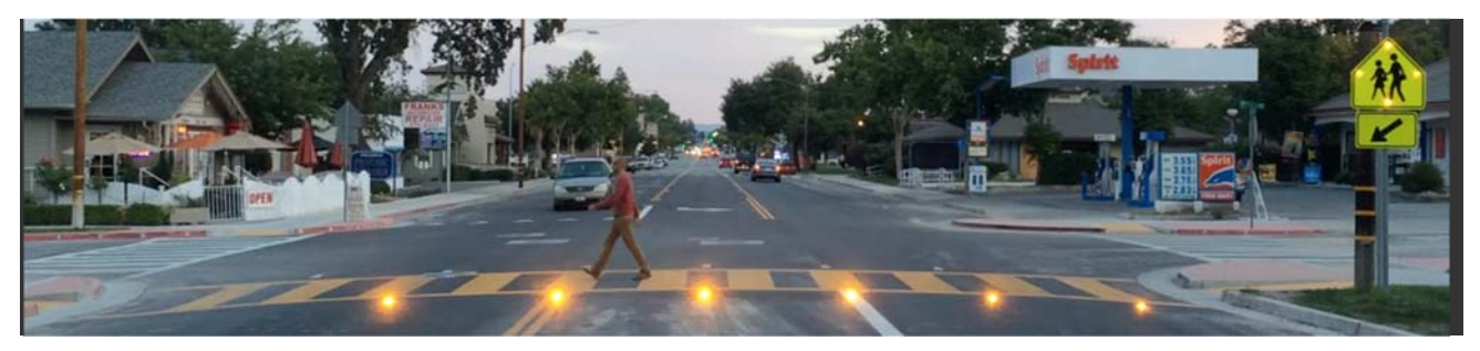
Tough & Durable