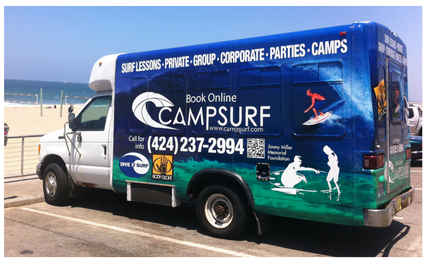
Campsurf Van in Los Angeles

At the sign of any conflict, we will search for a solution. We want to have a positive impact on all members of the community and will adapt however necessary to ensure harmony in our areas of business. At no point do we ever want to be "those guys" and we will be proactive about maintaining positive relationships with surrounding residents and businesses.