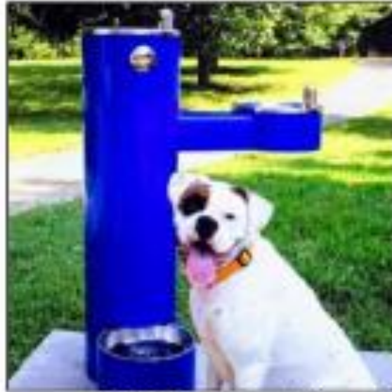
Drinking Fountain with Pet Bowl