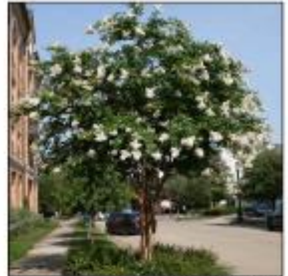
Small Shade Tree