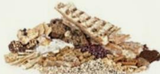
Bread, Pasta, Rice, Grains, Coffee Grounds & Food Soiled Paper