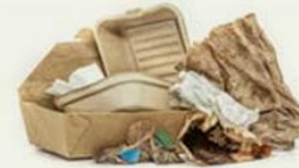
Food Soiled Paper, Coffee Filters & Tea Bags