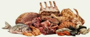
Meat, Fish & Poultry