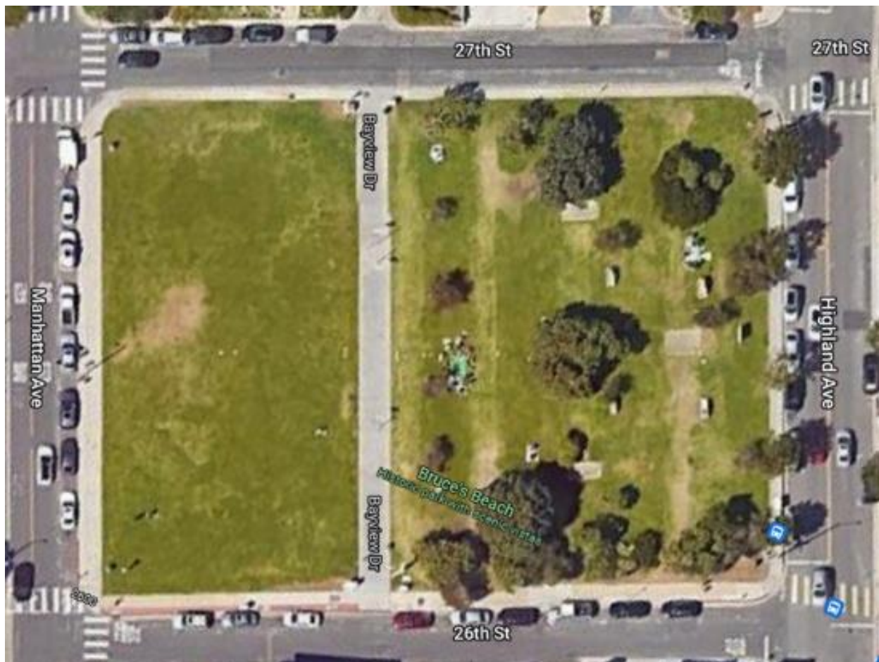
Aerial view of Bruce's Beach Park

The proposed artwork must take into account the size, location, topography, and current use of the park. The artwork may consist of one or multiple elements, may incorporate the new plaque and surrounding concrete pad*, and may be located anywhere in the park, so long as it meets all Americans with Disabilities Act (ADA) and other access requirements.** The artwork must present an educational and historical view of the events that lead to this day and have strong Diversity, Equity, and Inclusion ties.