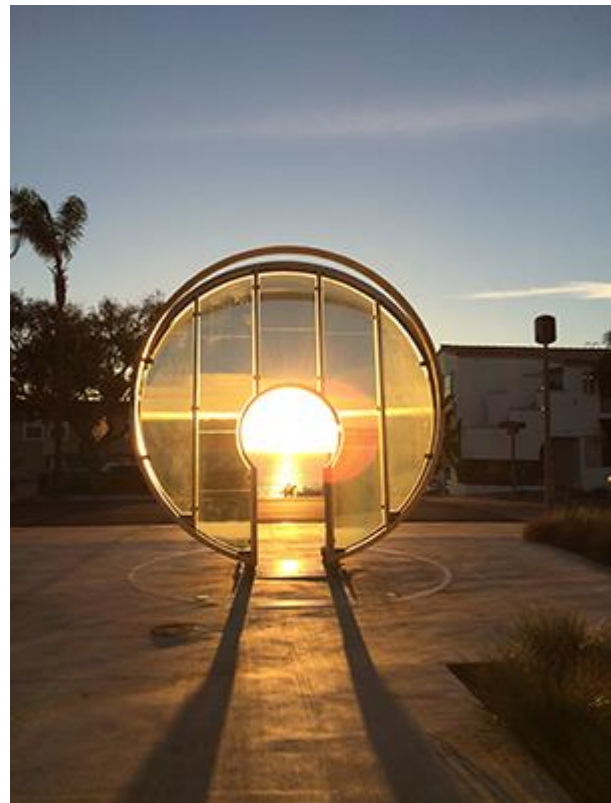
Light Gate , installed by the City of Manhattan Beach in 2014. This interactive artwork provides a view of the setting sun directly through the center of the keyhole twice a year.

The selected artist will collaborate with the City to refine and adjust the final proposal to meet City needs and expectations including but not limited to: aesthetic choices and considerations, thematic narrative, materials, size, location, and other aspects of the artwork.