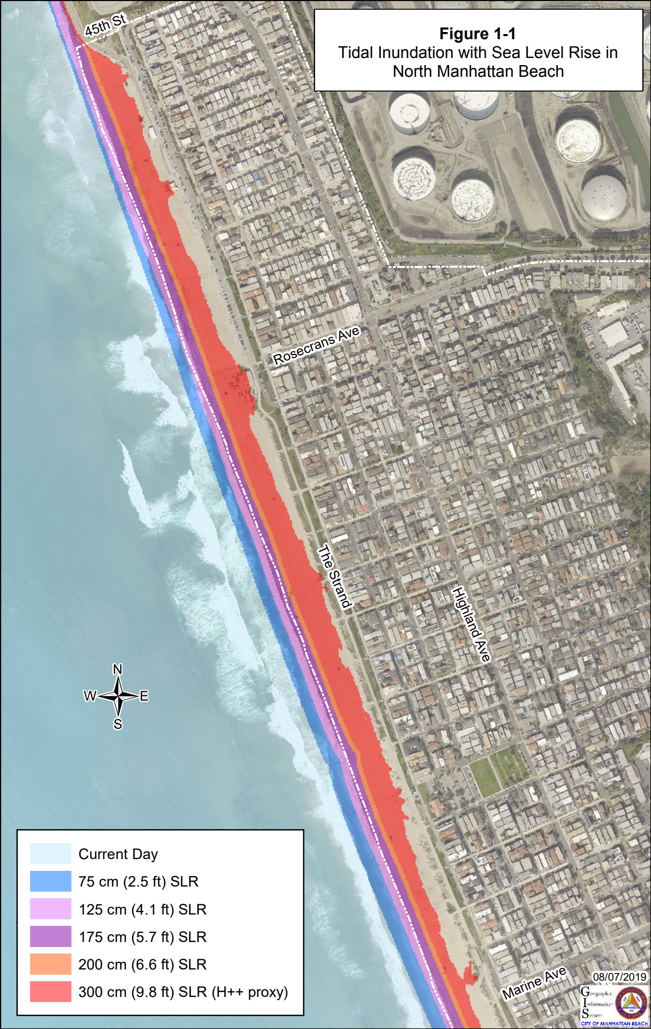
Figure 1-1 Tidal Inundation with Sea Level Rise in North Manhattan Beach