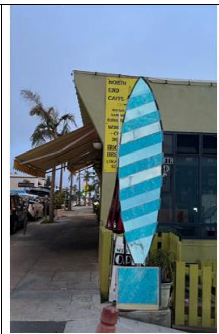
<u>Image 2</u> – Artwork as it appears on Site