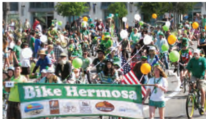
Bike Entry in the St. Patrick's Day Parade