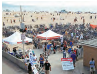
Fiesta Hermosa Bike Corral