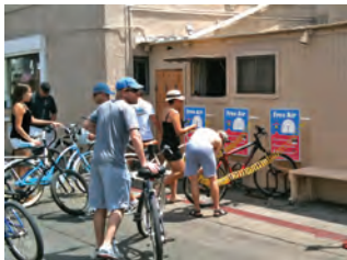
Free Air For Your Bike Tires