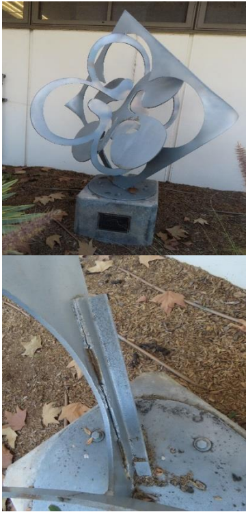
Mankind's Struggle for Eternal Peace