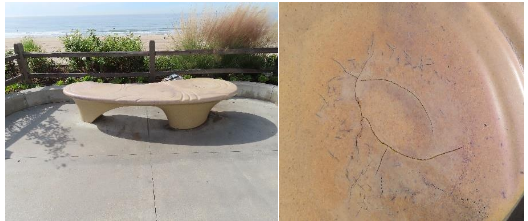
Strand Bench Content