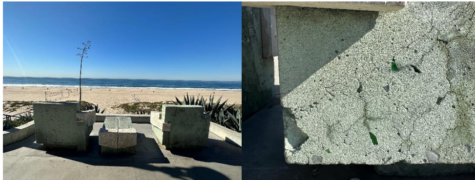
Escobar Sculpture Bench