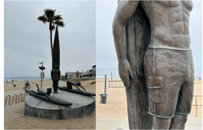
Catalina Classic Memorial Statue