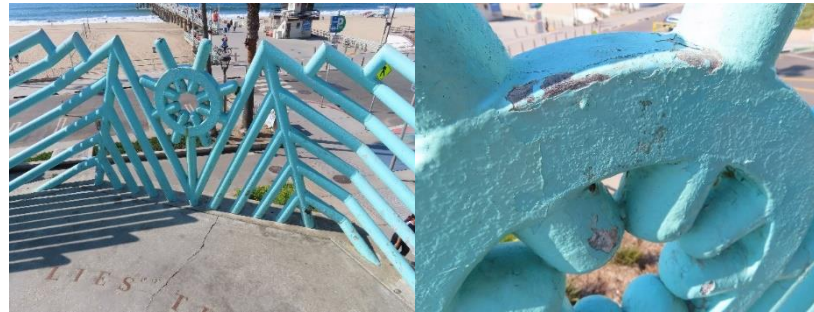
Beyond this Point Lies the Rest of the World