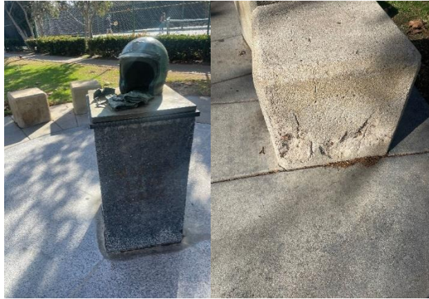
Martin Ganz Memorial