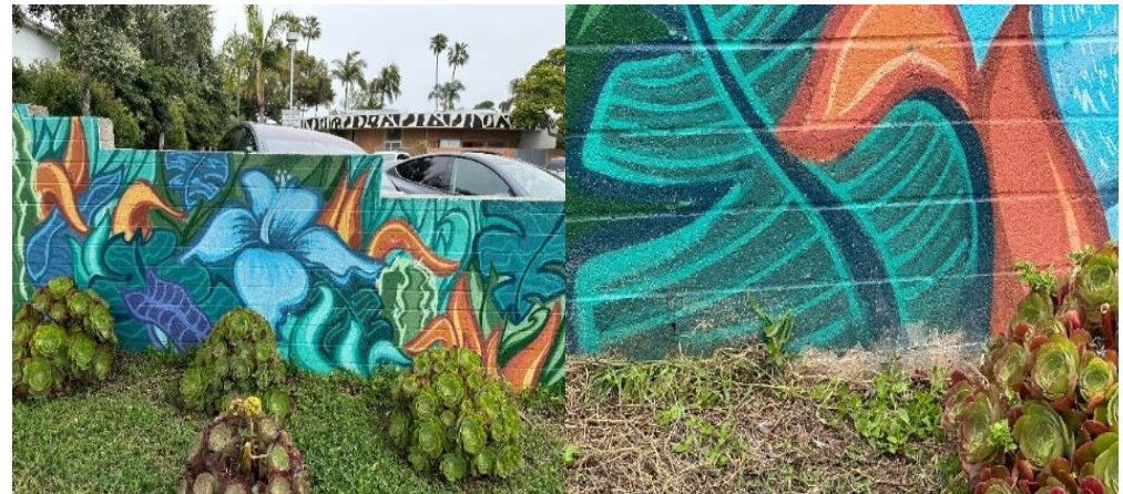
Leadership MB Community Mural