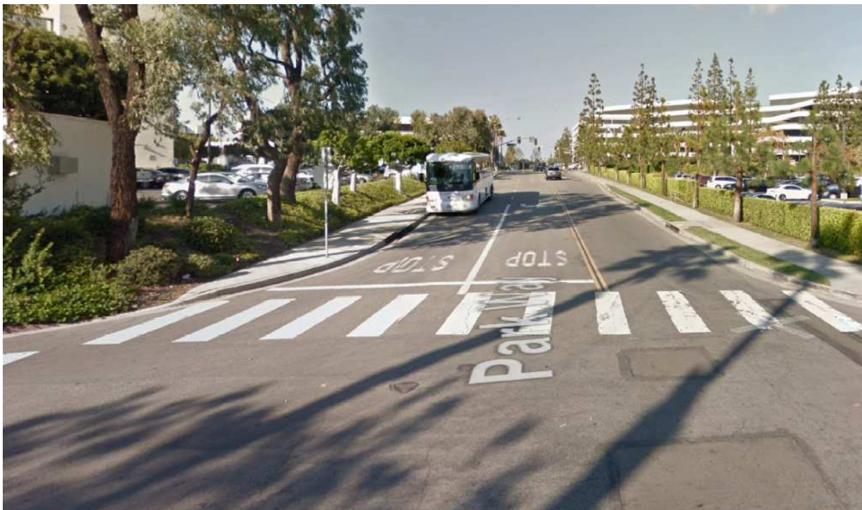
Park Way Looking North