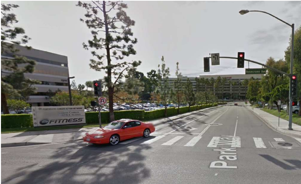
Park Way Looking South