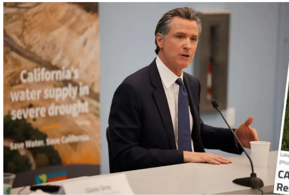
Gov. Gavin Newsom addresses California's water suppliers at a meeting on Monday.