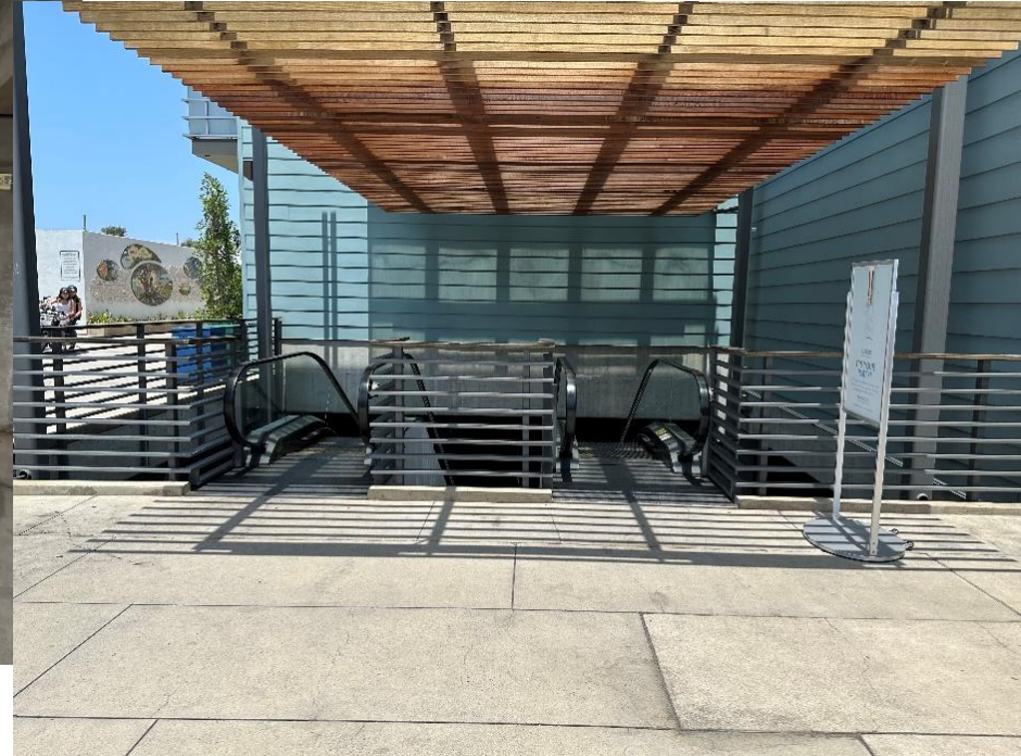
Escalators at Ground (Top) Level