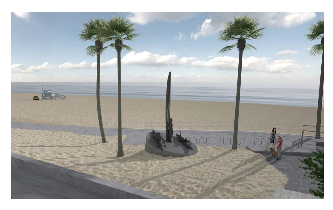
EXHIBIT A PROJECT CONCEPT PLANS