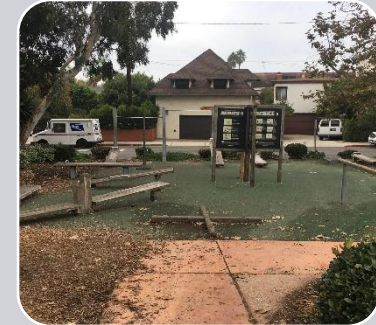
Veterans Parkway (Mariposa) Fitness Station