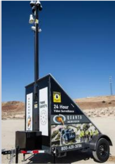
Security Camera Trailer