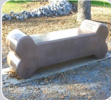
Dog Bone Benches