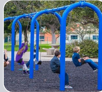
Pour in Place Playground Surfacing