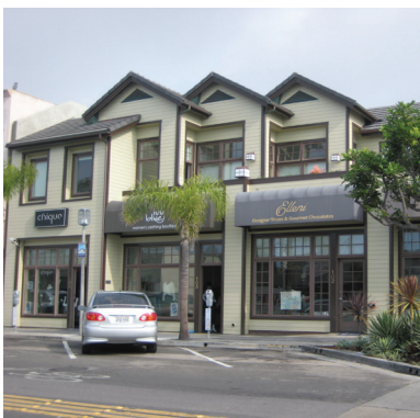
Figure 6.13 Building mass has been broken into smaller forms