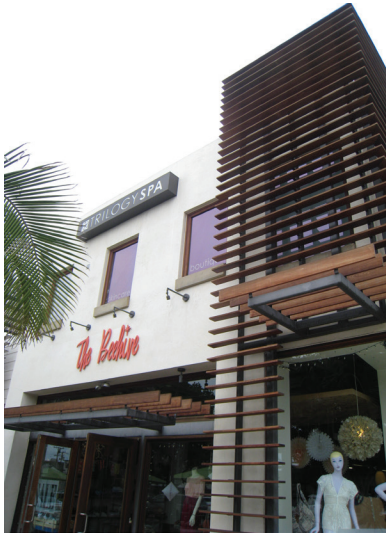
Figure 6.20 Awnings provide cover for pedestrians