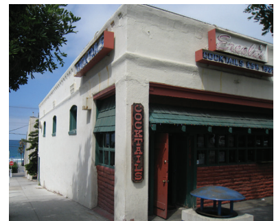
Figure 6.2425 1101 Manhattan Ave is the oldest commercial building in the Downtown

Downtown Manhattan Beach's buildings incorporate a variety of architectural styles, inspiring the district with an eclectic identity. To perpetuate the project area's architectural variety, development should seek to preserve historic structures. In addition to the City's Historical Preservation Code, the following guidelines should be considered, where feasible, in The following guidelines apply to the alteration of historic buildings and construction of new buildings and additions adjacent to such resources. For information pertaining to optional voluntary historic preservation regulations, refer to the Manhattan Beach Municipal Code - Historic Preservation Code Chapter 10.86 and A.86 of the Local Coastal Program (pending final Coastal Commission Approval).