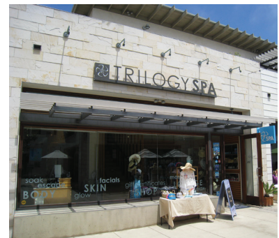
Figure 6.1718 Mix of high-quality building materials