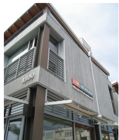
Figure 6.1819 A variety of materials, colors, and textures creates visual interest