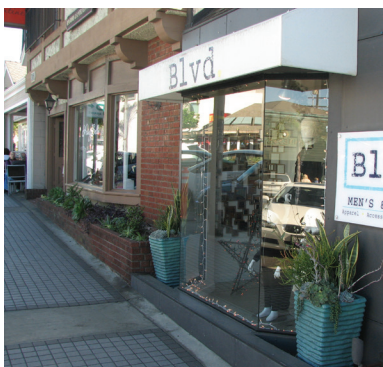
Figure 6.1617 Transparent windows along ground-floor retail