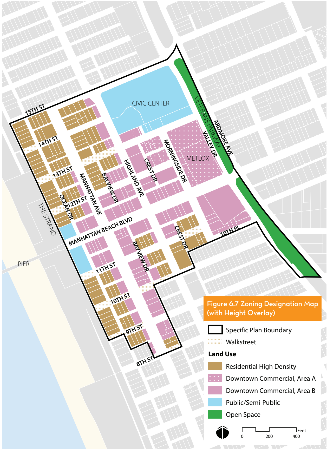
Figure 6.7 Zoning Designation Map (with Height Overlay)