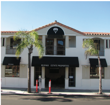
Figure 6.21 Awning shape relates to window and door openings