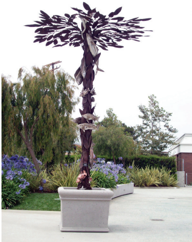
Figures 6.4142-6.4243 Sculpture garden artwork