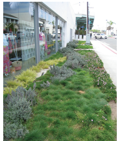
Figure 6.32 Landscaped character complements adjacent architecture

Landscaping should be native and/or drought-tolerant