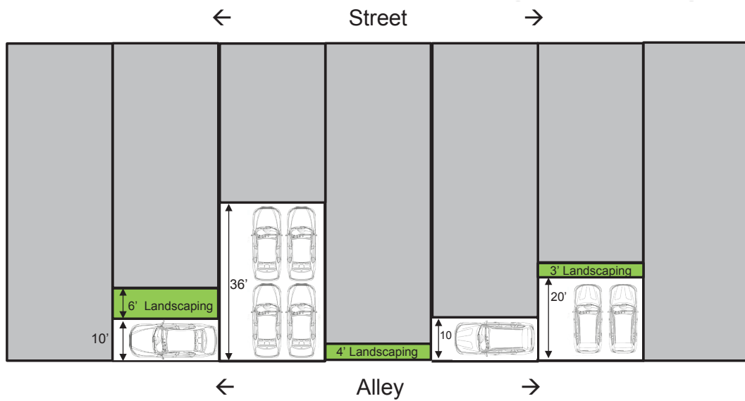
Figure 6.8 Minimum Rear Yard Setback - CD Zone (on alleys)

All properties shown above conform to the rear yard setback requirement.