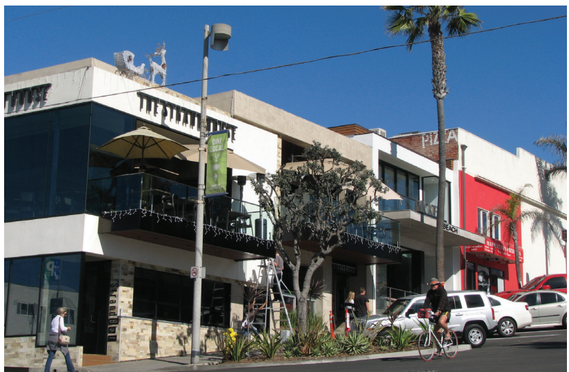
Figures 6.1-6.6 Existing Downtown development