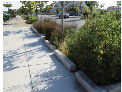
Figures 6.4445-6.4546 Planting strips and bioswales help reduce and filter stormwater