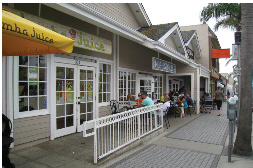
Figures 6.3536-6.4041 Outdoor dining arrangements