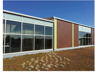
Figure 6.4544 Green roofs absorb heat and rainwater