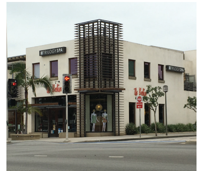
Figure 6.910 Corner entrance emphasized through unique articulation and materials