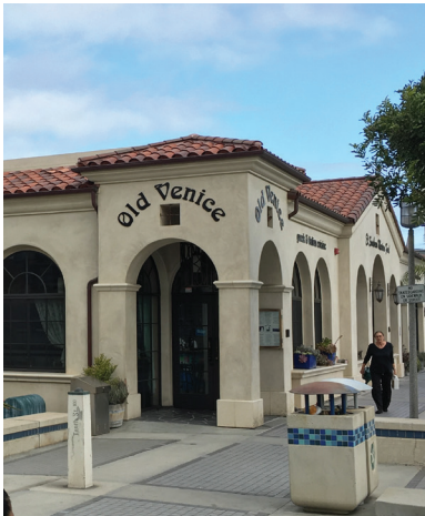
Figure 6.12 Inviting corner entrance with tower feature

Downtown Manhattan Beach is predominantly composed of compact blocks and narrow parcels that mostly occupy limited street frontage. The massing and scale of Downtown's existing buildings reflect these dimensions, contributing to the area's vibrant, pedestrian-oriented streetscape. Building heights range from one to three stories and building setbacks are limited. The Downtown contains a number of finely detailed buildings in variety of styles which contribute to the area's unique quality and help define its pedestrian scale. To complement the project area's massing, scale, and character; new development should consider the following guidelines.