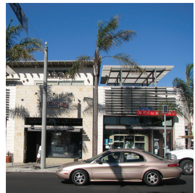
Figure 6.115 Balconies and roof gardens activate stepback areas