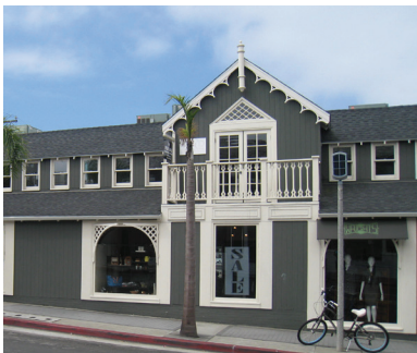
Figure 6.1616 Detailed architectural treatments enhance the facade