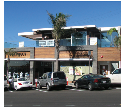
Figure 6.114 Upper story steps back