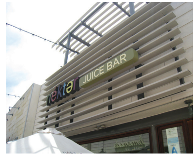
Figures 6.33-6.34 Signage should be high-quality, pedestrian-oriented, and compatible with the building style