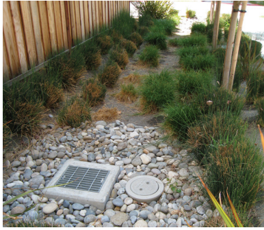
Figure 6.3233 Vegetated bioswale filters stormwater